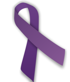
Domestic Violence Awareness